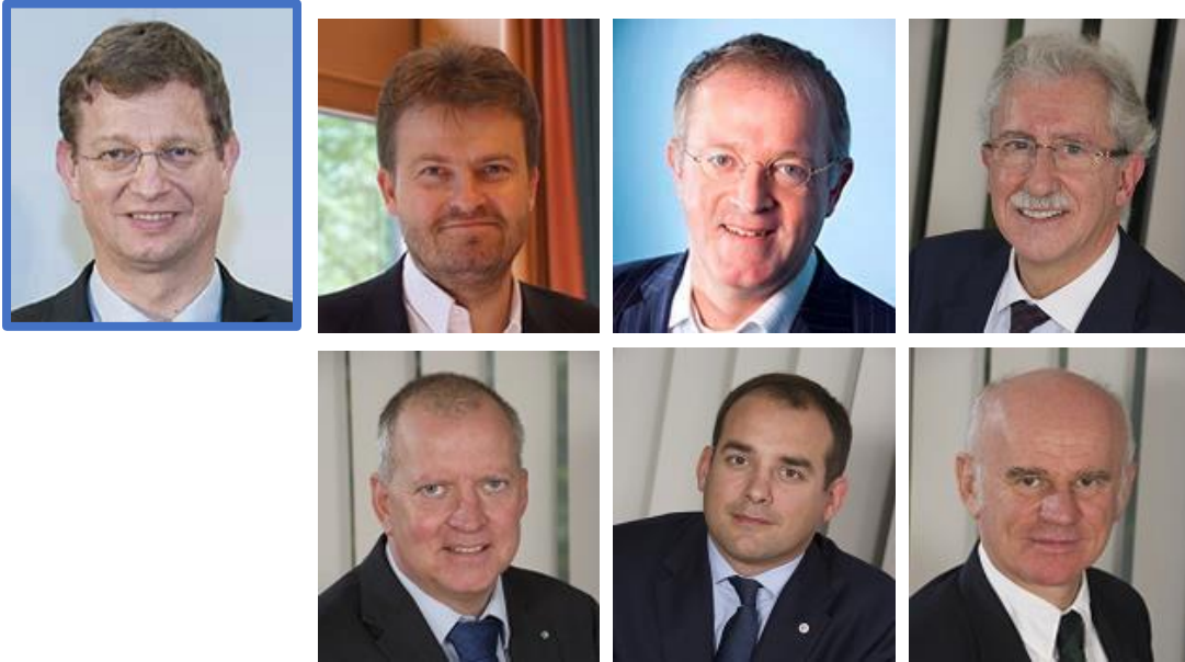
EEA – Management Committee (MC)