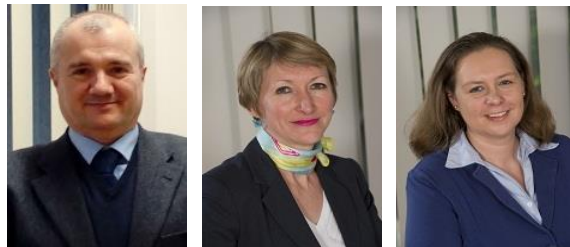
EEA - Office Team